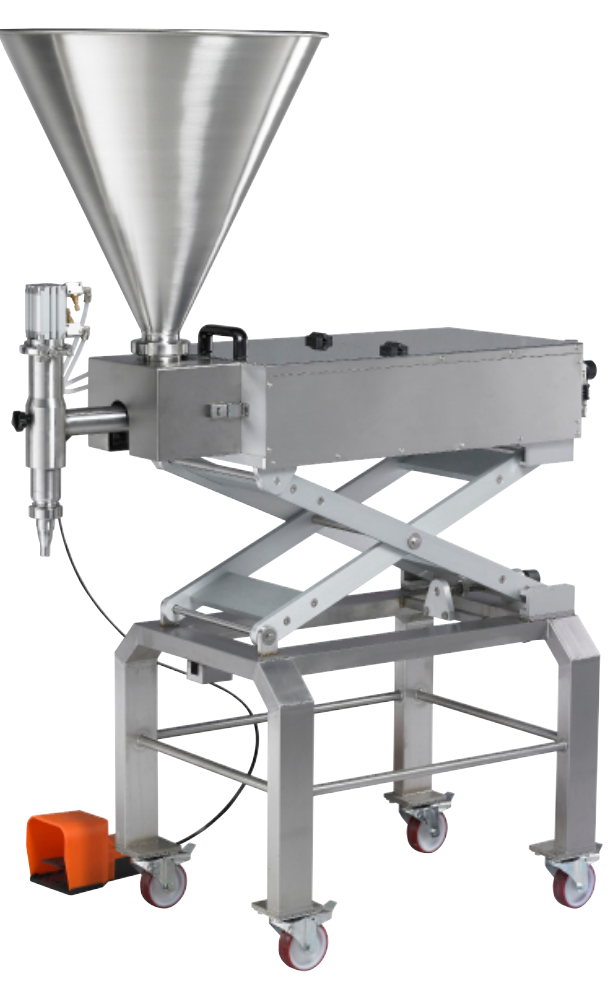
DP-48 w/ adjustable height base